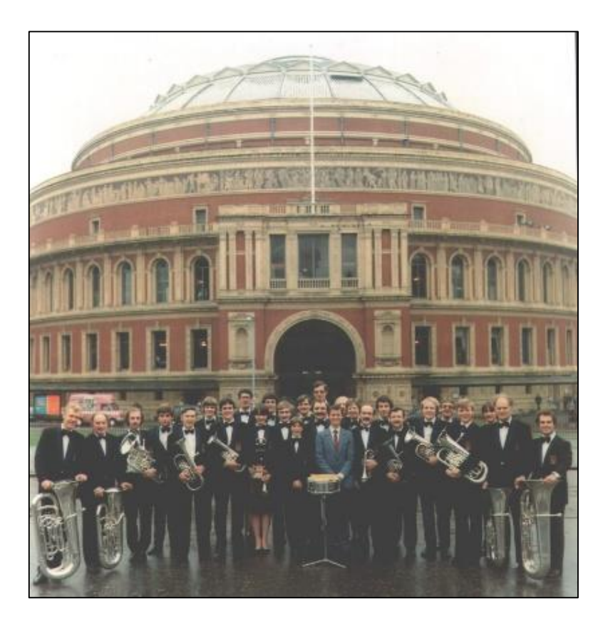
Hitchin Band, Royal Albert Hall, 1983