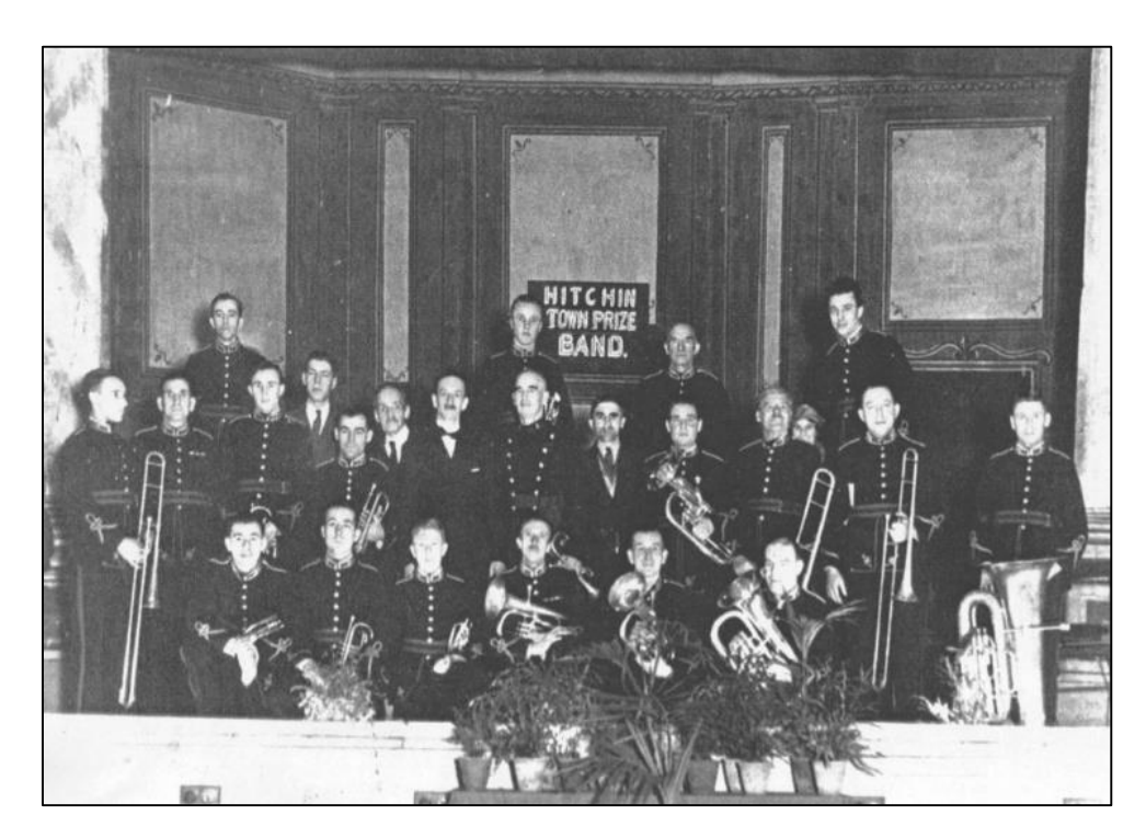
Hitchin Town Prize Band, 1928