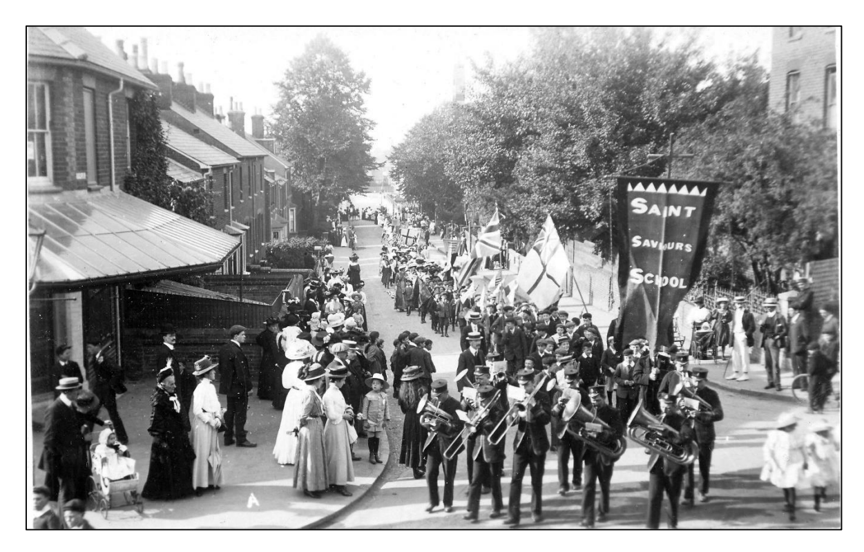
Hitchin Band, Hitchin, 1900