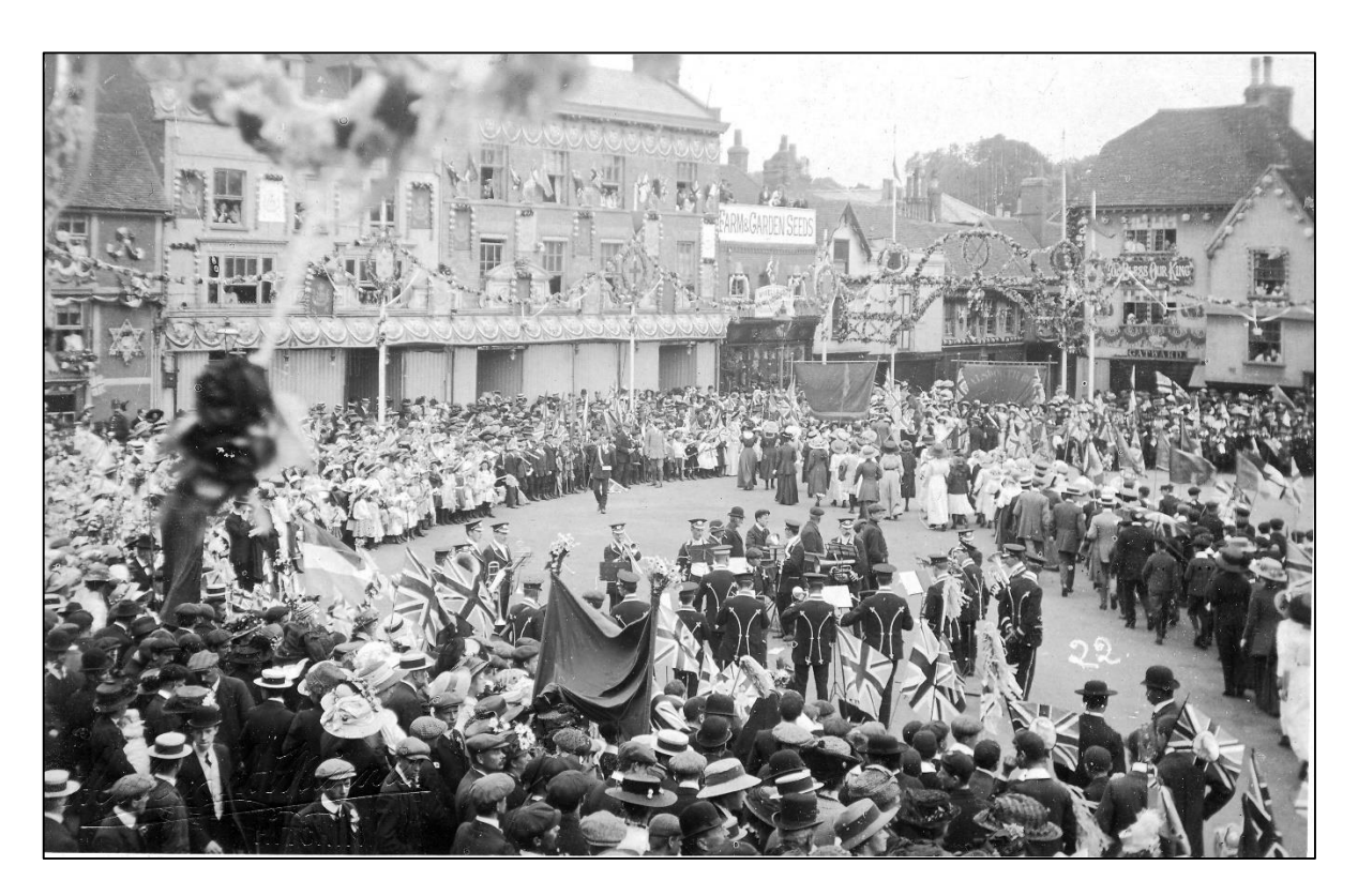
Hitchin Band, Hitchin, 1911